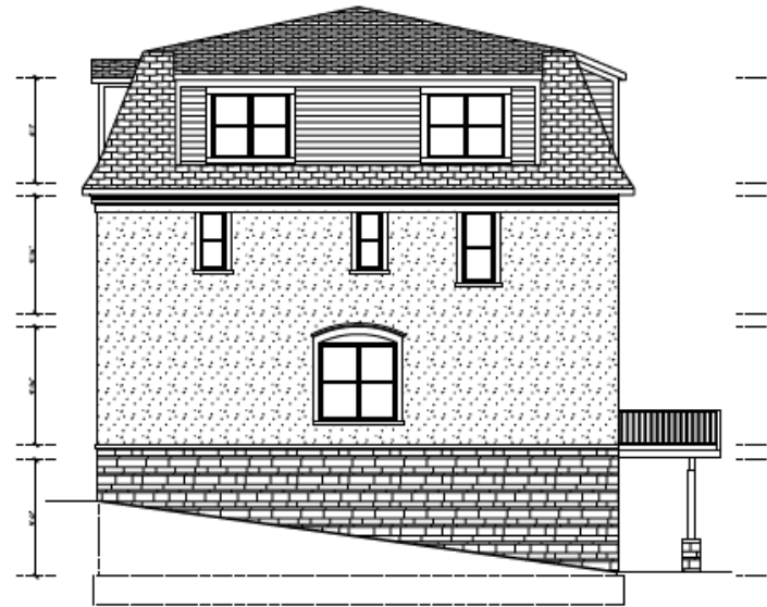
Side Elevation SCALE: No Scale